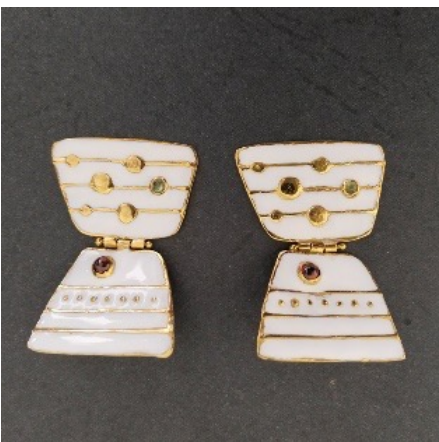
Earrings "Zoom II" . Brass dipped in 21 Ct Gold, White Enamel, Tourmaline, Garnet. # 1/8 800 USD