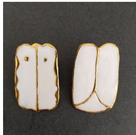
Earrings "Faces" . Brass dipped in 21 Ct Gold, White Enamel. #1/8. 600 USD