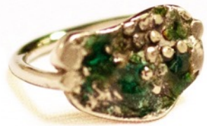
Ring Rhodium plated silver, copper and enamel 85 USD