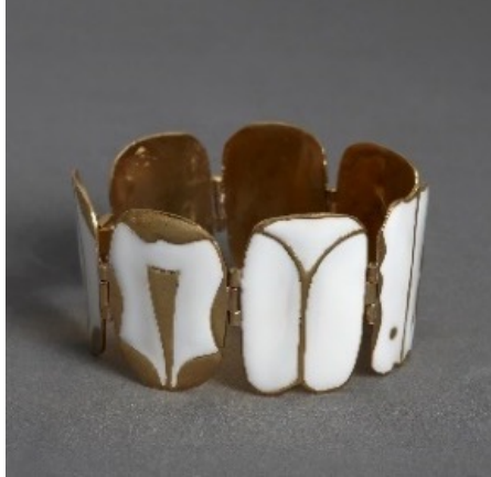
Bracelet "Faces" . Brass dipped in 21 Ct Gold, White Enamel. # 2/8. 1 000 USD