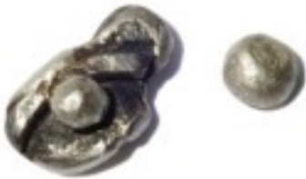
Pair of organic silver earrings 50 USD