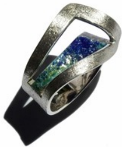
'Moving Nature' Silver & Enamel ring 145 USD