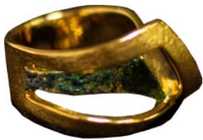
'Moving Nature' Goldplated brass & Enamel ring 130 USD