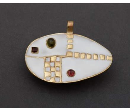
Pendant "Zoom I" . Brass dipped in 21 Ct Gold, White Enamel, Vermeil Chain, Tourmaline, Garnet. # 2/8 1 200 USD