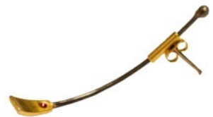
Single kinetic gold plated earring 40 USD