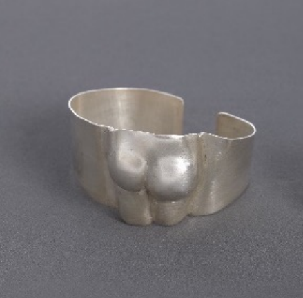
Bracelet "Butts" . Brass dipped in 21 Ct Gold. # 2/8. 900 USD