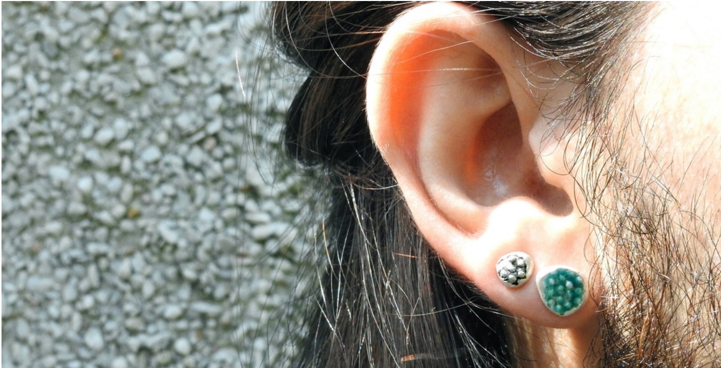
Pair of round silver & enamel earrings 45 USD