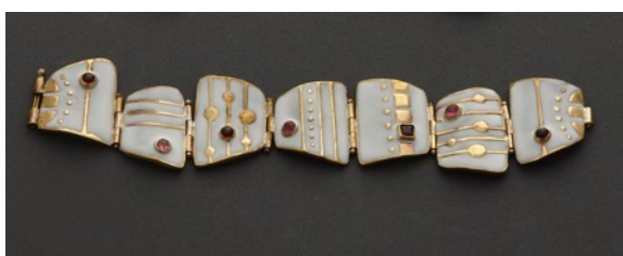
Bracelet "Zoom I" . Brass dipped in 21 Ct Gold, White Enamel, Tourmaline, Garnet. #1/8. 1 200 USD