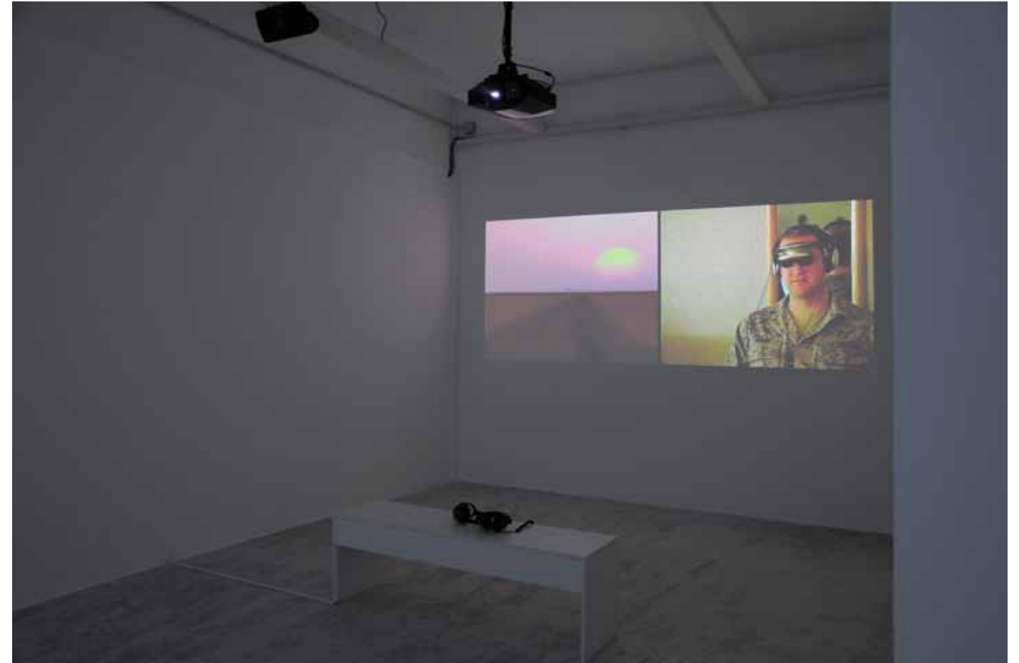
Serious Games - Exhibition view

Farocki continues his commentary on the history of cinema in On Construction of Griffith's Films (2006), analysing the innovation of the shot and countershot during a dialogue sequence from Griffith's 1916 film Intolerance . Although this technique is now omnipresent in film, Farocki uses the sequence to illustrate an important milestone in the growing independence of cinematography.