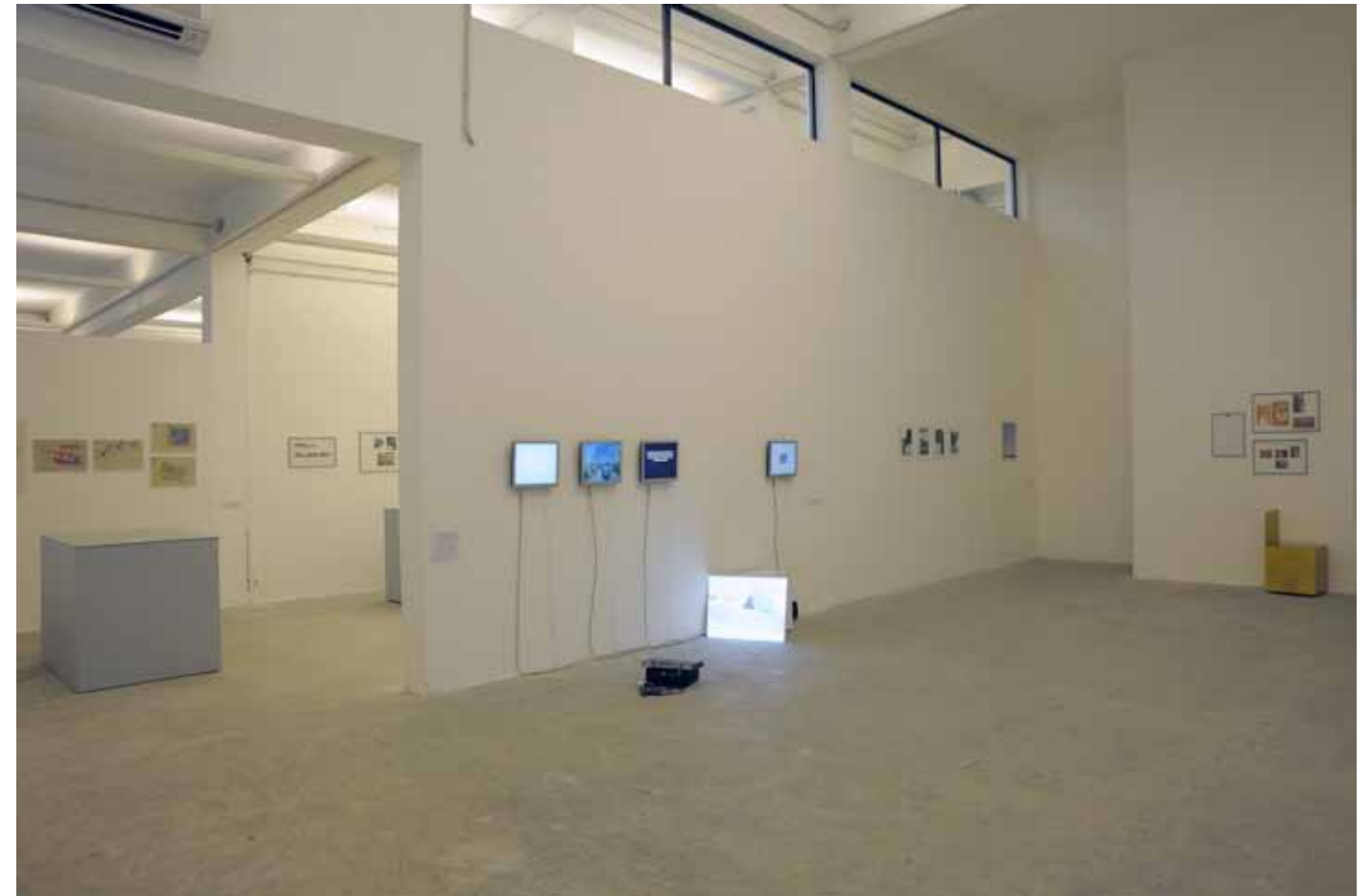
Drawing with the Things Themselves - Exhibition View

The exhibition at Beirut Art Center will present a selection of works: performative photographs, photomontages, photographs, drawings, objects, models, texts, slideshows and video clips produced by the artist over the last twenty years, underlining her artistic processes and articulating what is at stake in her work today.