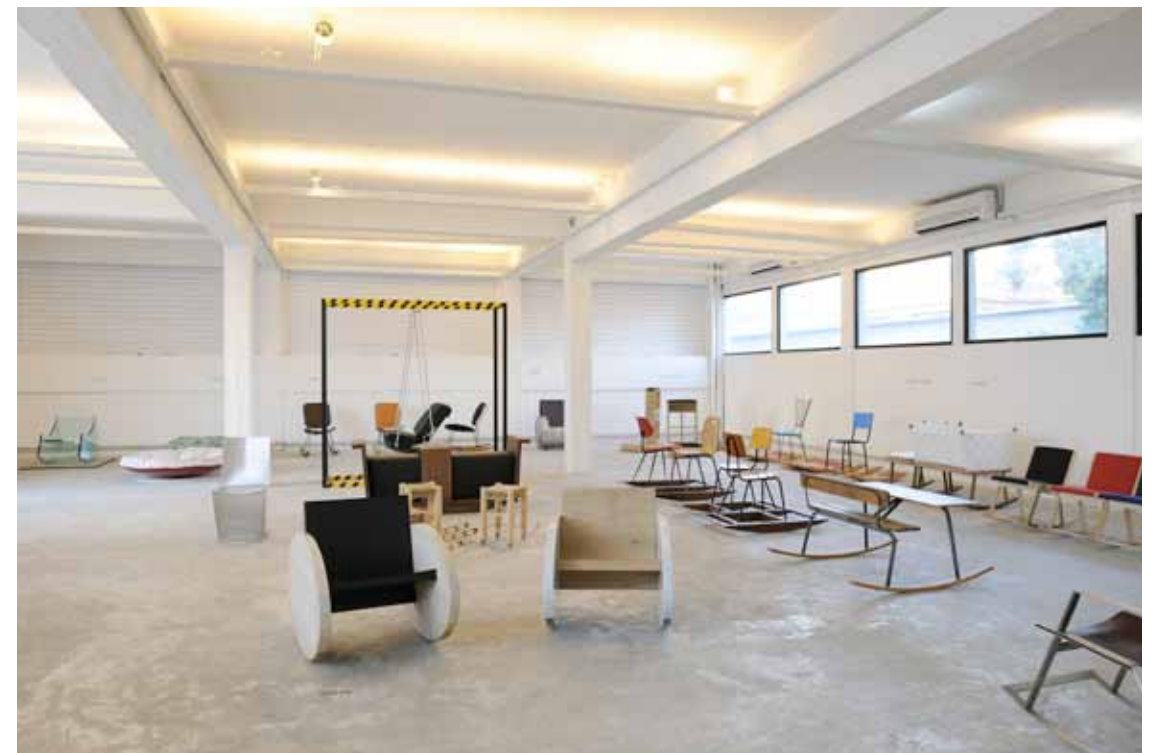
Beirut Rock Center