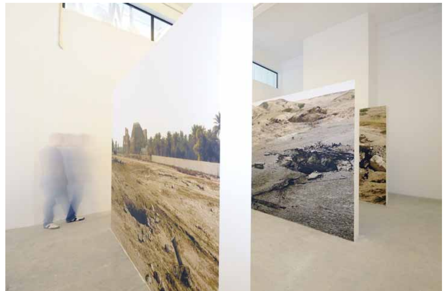
Sophie Ristelhueber - Eleven Blowups