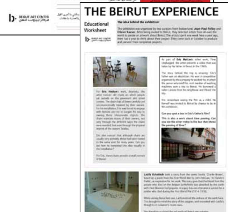
Examples of Educational Sheets