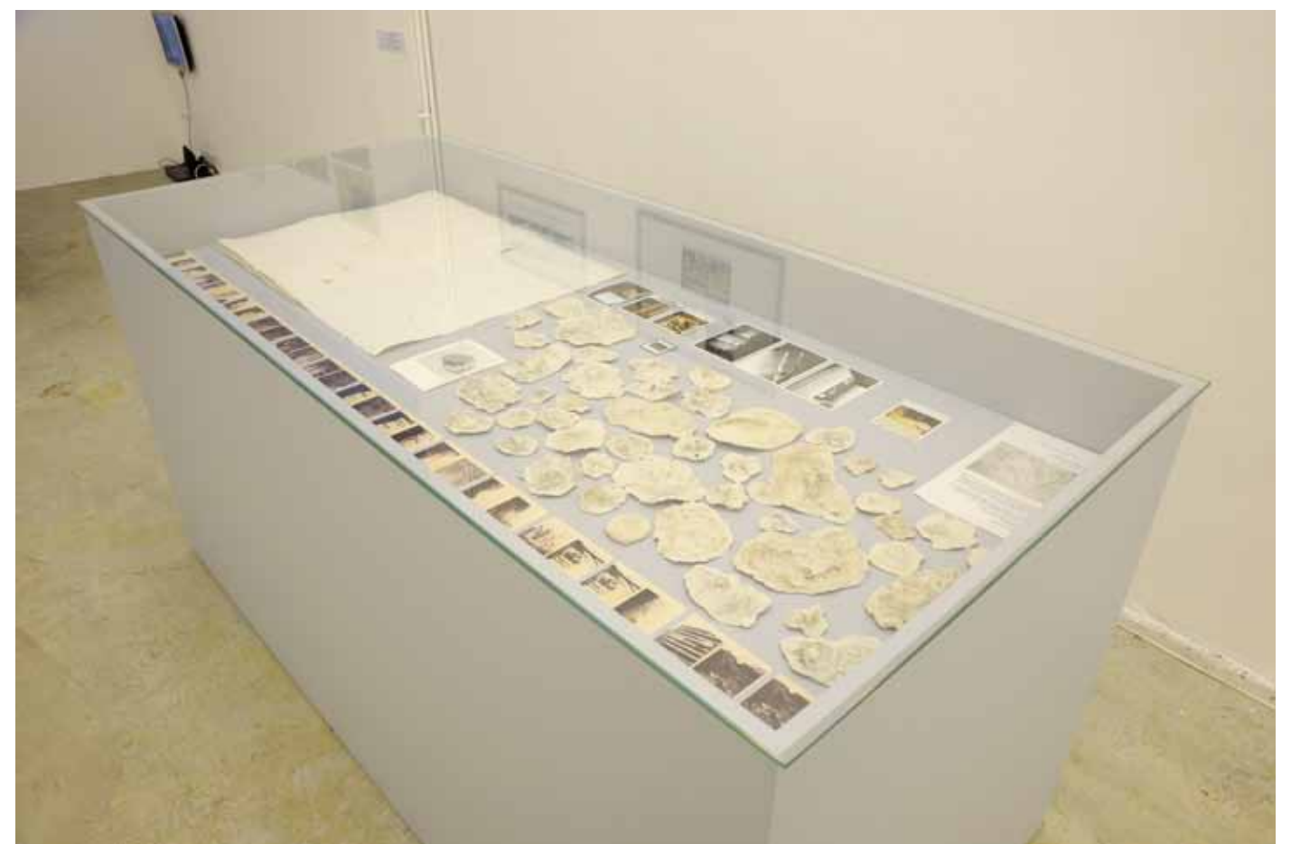
Drawing with the Things Themselves - Exhibition View