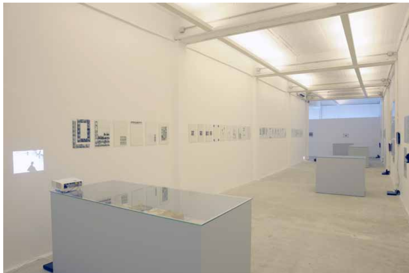
Drawing with the Things Themselves - Exhibition View