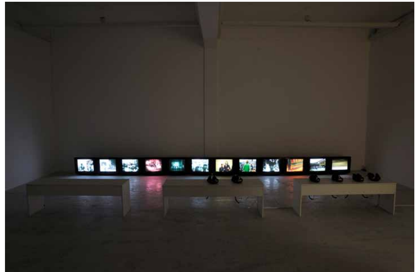
Workers Leaving the Factory in Eleven Decades - Exhibition view