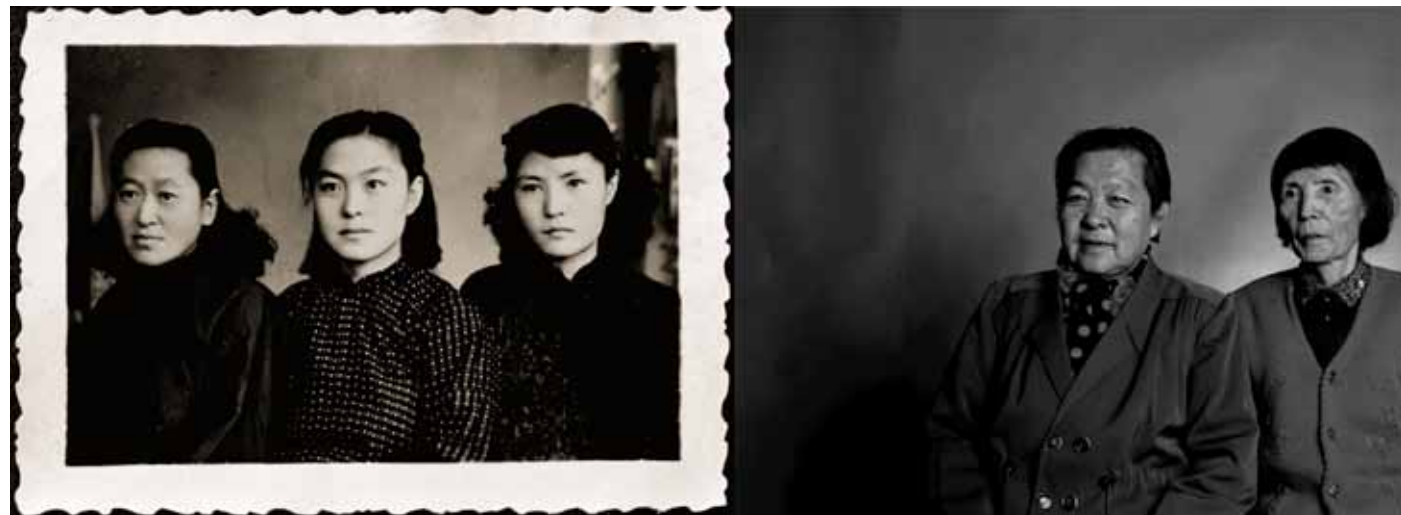
Hai Bo, Three Sisters (2000) © Hai Bo. Courtesy of The Pace Gallery, Beijing

The exhibition will be accompanied by a series of screenings, lectures and roundtables with the aim of extending reflection on these historical events and reflecting on their present impact. Other events will be dedicated to discussing and reflecting on the actual situation in the Arab world.