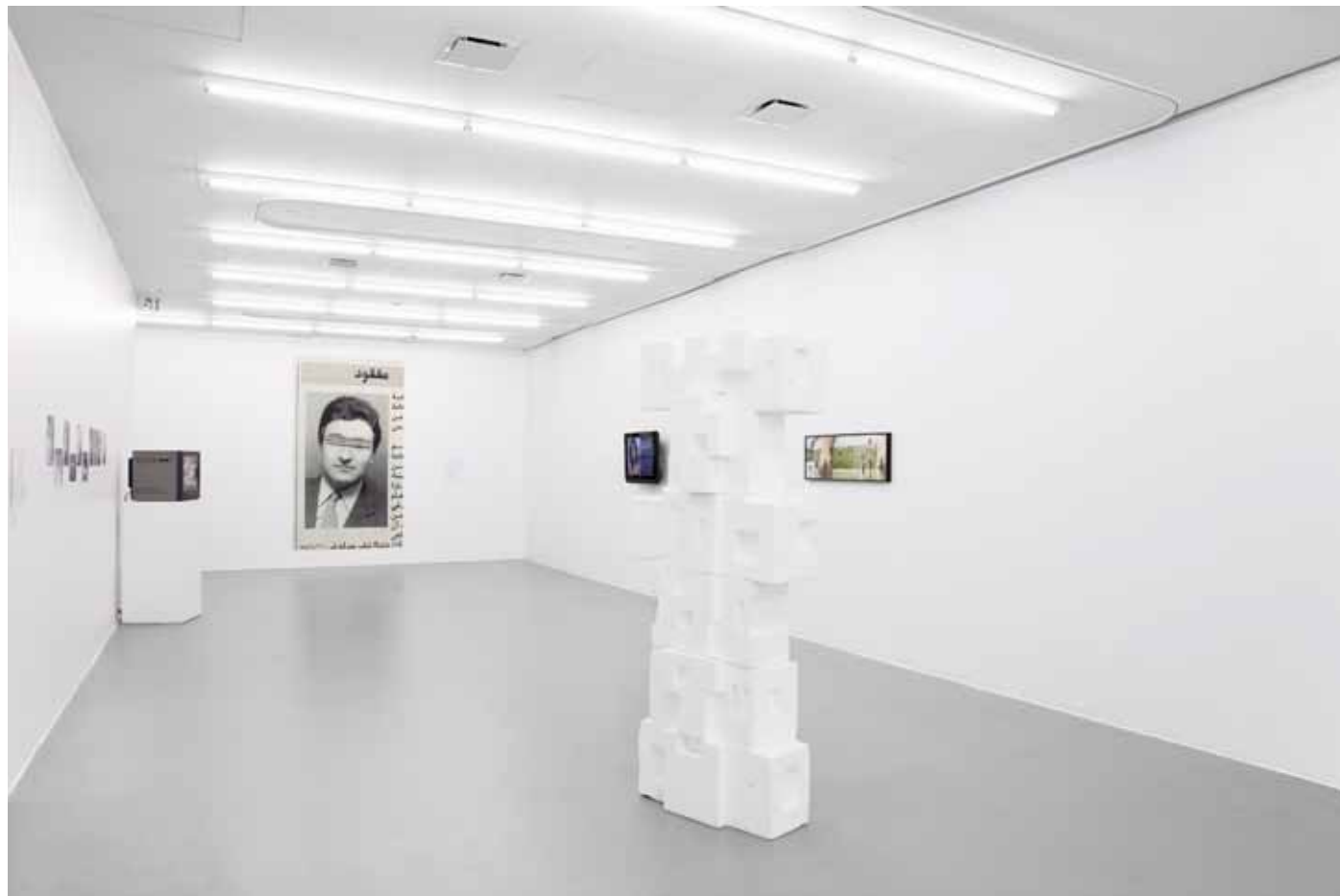
Due to unforeseen events - Exhibition View