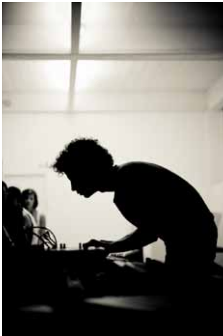
OkyDoky - The Ruptured Sessions