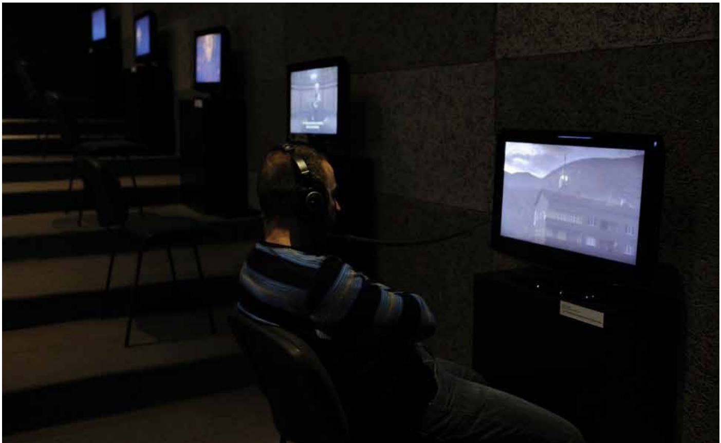
Art in the Auditorium