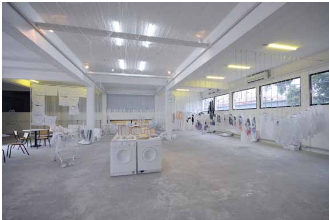
STARCH your summer