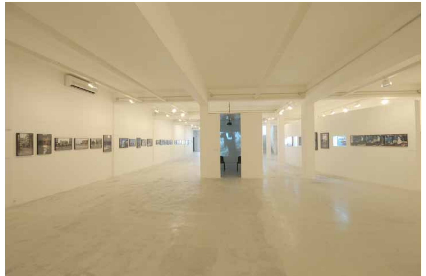
Be...longing - Exhibition view