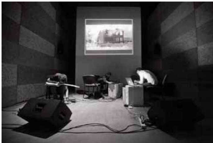
Under the Carpet - The Ruptured Sessions