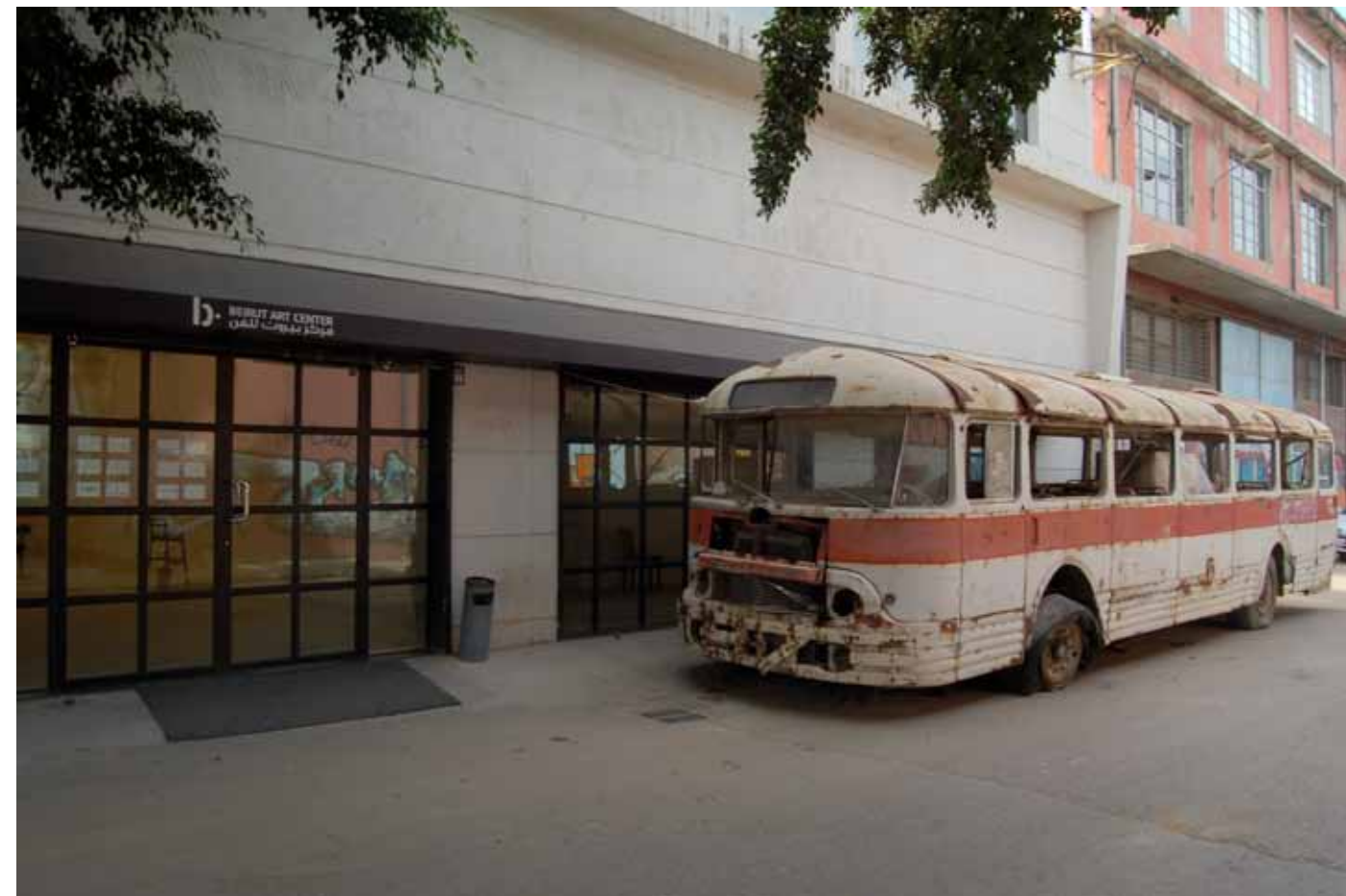
The Beirut Experience - Exhibition view

Pro Helvetia – Swiss foundation for culture / Swiss Exhibition Award 2008 given to attitudes by Julius Bär Foundation and Swiss federal Office for culture / Fonds cantonal d'art contemporain, Etat de Genève (Contemporary Art Fund, State of Geneva) / Mondriaan Foundation / Institut français (French Institute) / French Embassy in Lebanon / Swiss Embassy in Lebanon / Stanley Thomas Johnson Foundation / Georges Foundation.