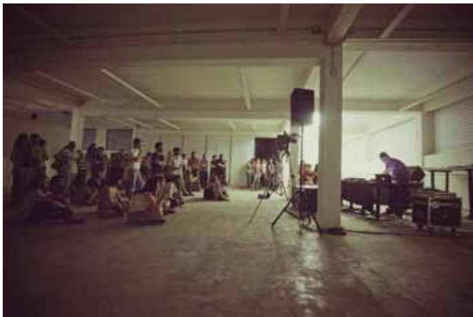
Munma - The Ruptured Sessions