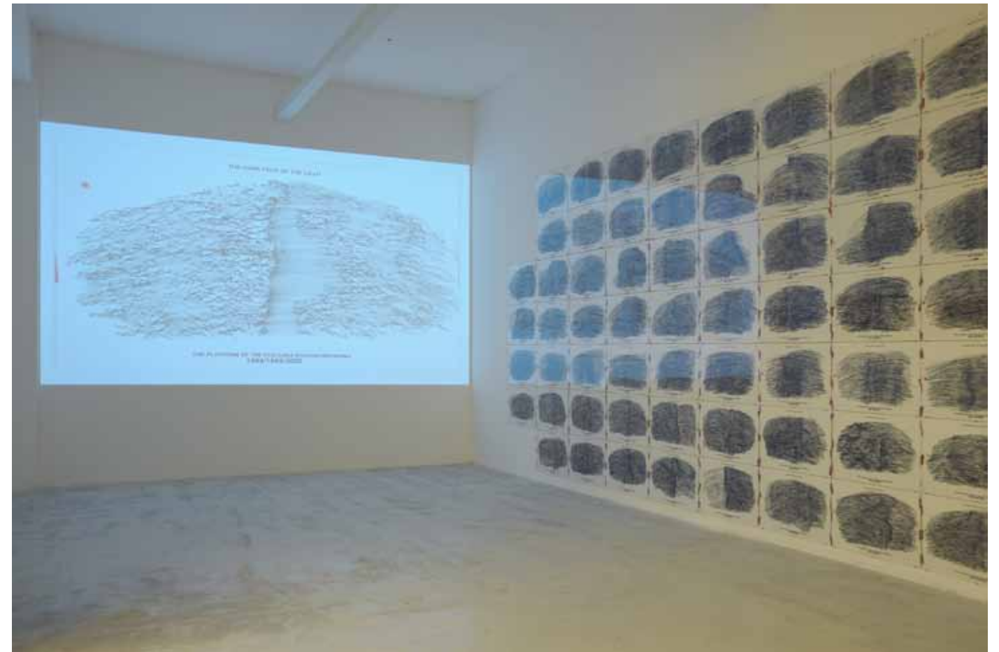
Masao Okabe & Chihiro Minato - The Dark Face of the Light