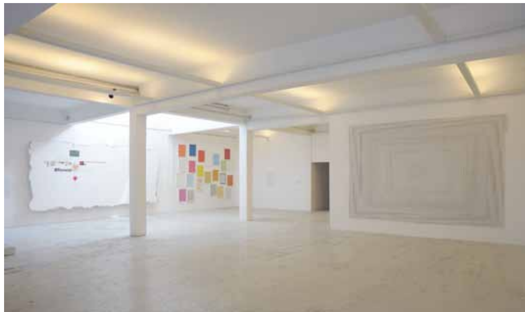
Image in the Aftermath Exhibition view