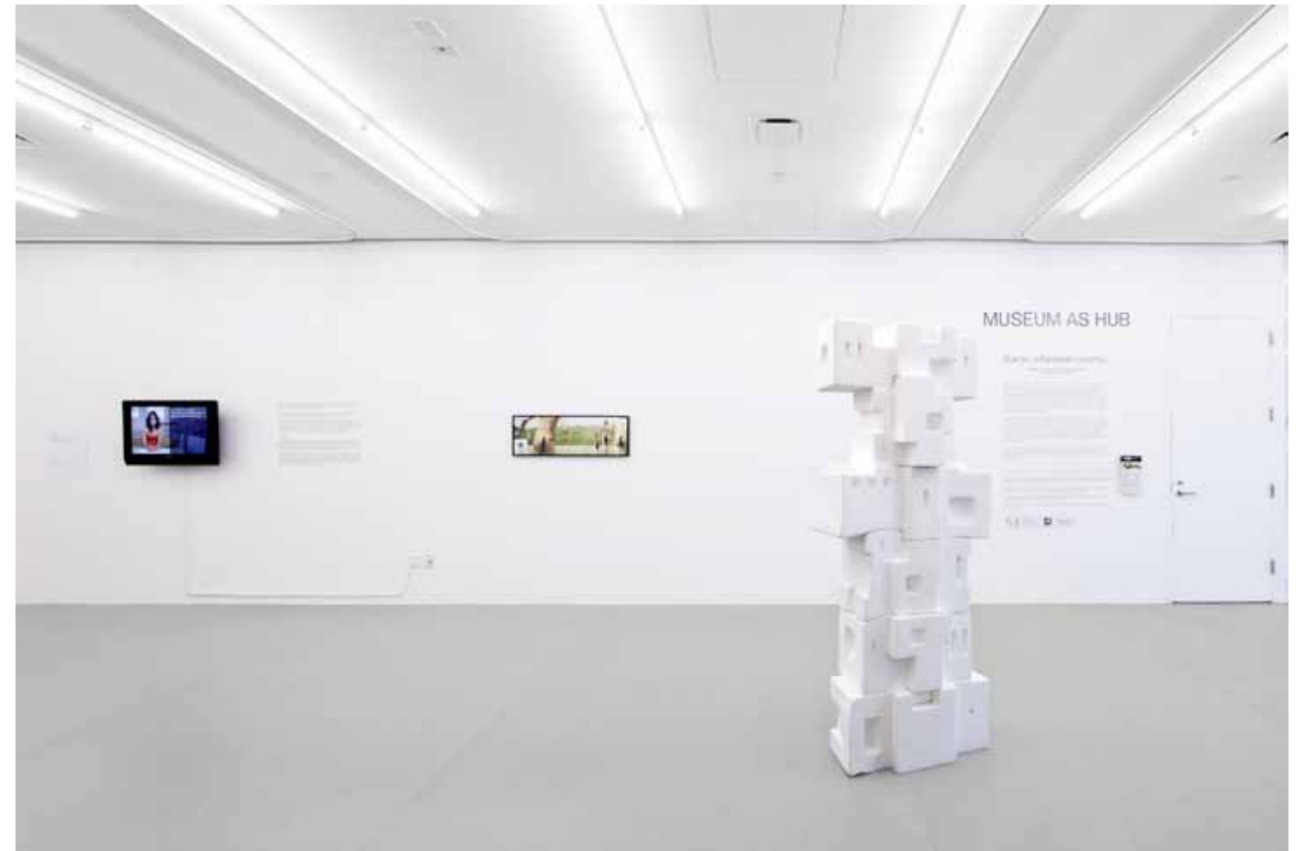
Due to unforeseen events - Exhibition View

Beirut Art Center has also organized a series of public performances and screenings in conjunction with the exhibition. Sandra Dagher and Lamia Joreige