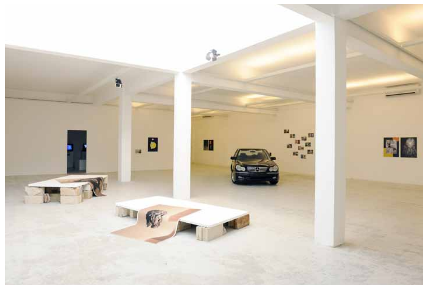
Exposure 2011 - Exhibition view