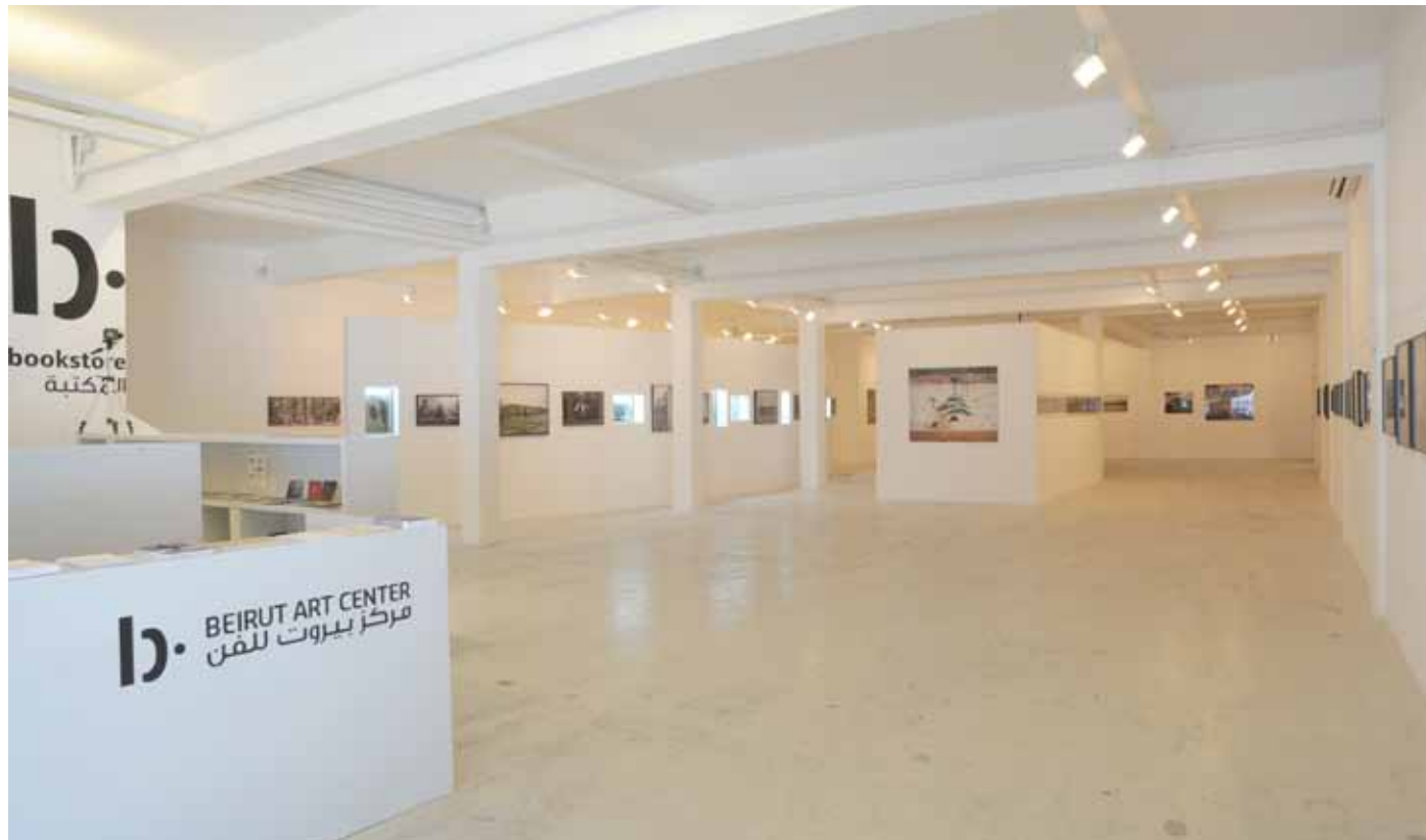
Be...longing - Exhibition view