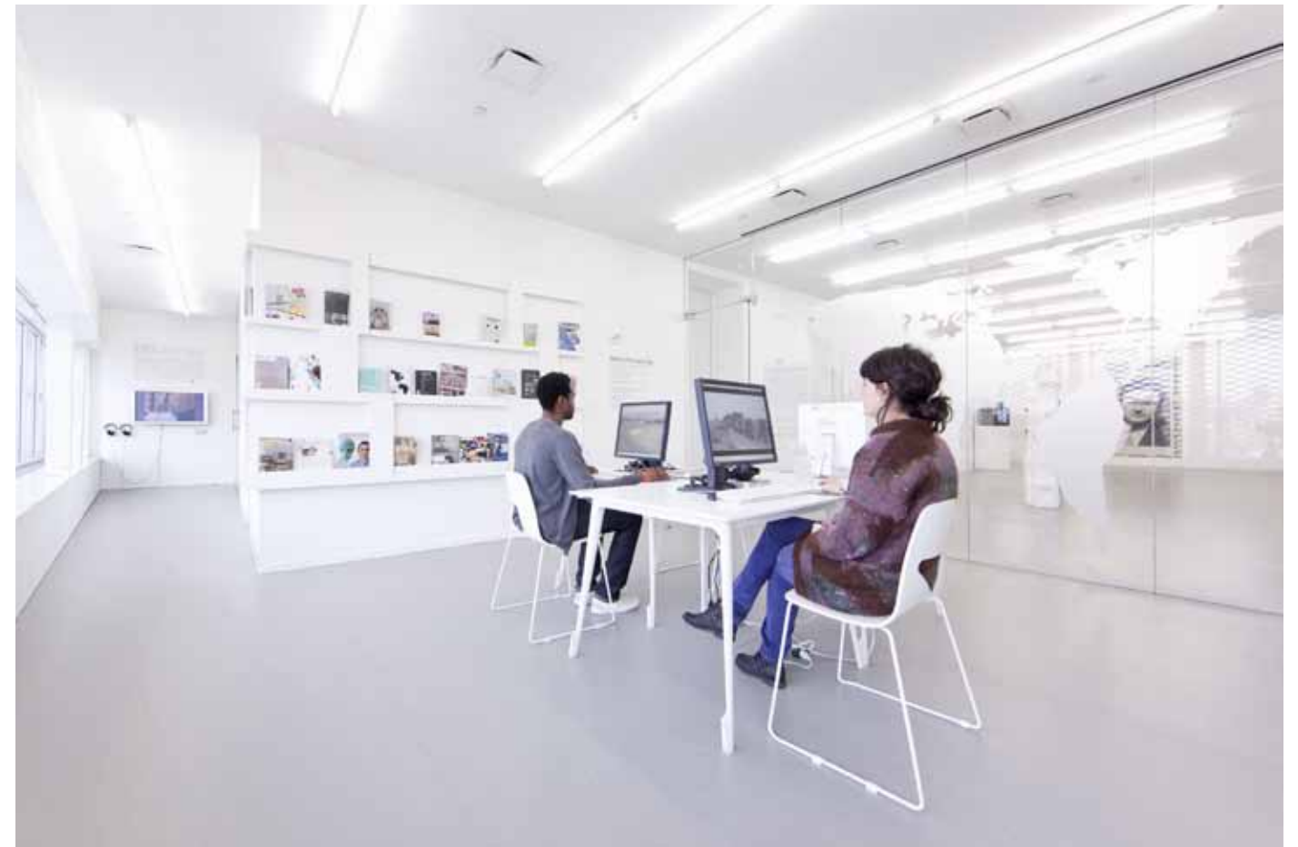
Due to unforeseen events - Exhibition View