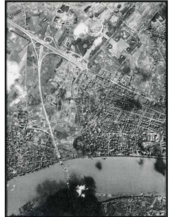
Gerhard Richter Bridge 14 FEB 45

The exhibition will be a unique opportunity for the Lebanese public to engage with the work of one of the world's most important and renowned visual artists, who throughout his long career has explored the language and possibilities of painting and image-making.