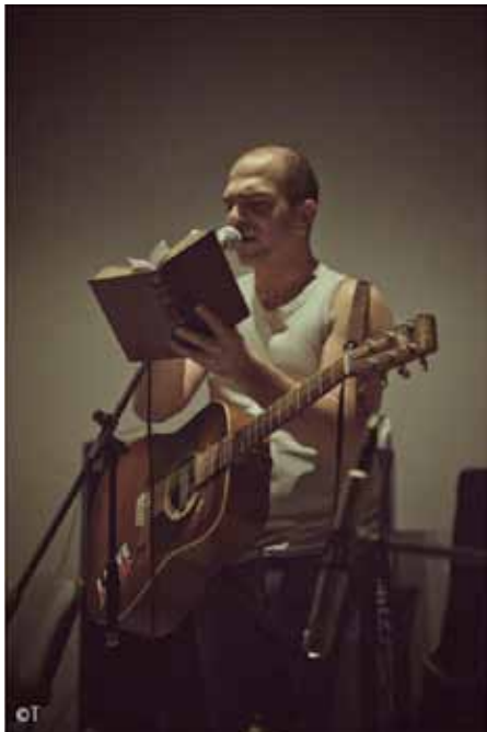
The Incompetents Live